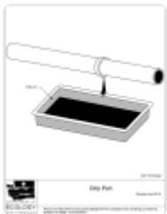
Figure IV-6.2: Drip Pan