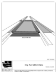
Figure IV-6.3: Drip Pan Within Rails

Install a drip pan system as illustrated (see Figure IV-6.3: Drip Pan Within Rails ) within the rails to collect spills/leaks from tank cars and hose connections, hose reels, and filler nozzles.