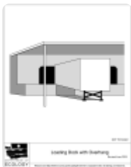
Figure IV-6.5: Loading Dock with Overhang