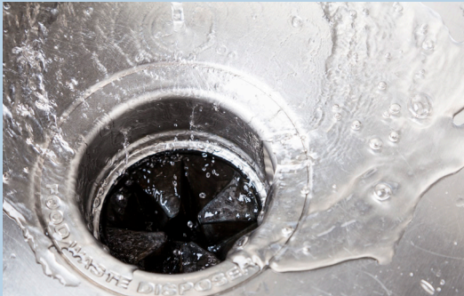
Friend or foe? Learn how to make the best use of your garbage disposal

Kitsap County Public Works | Sewer Utility