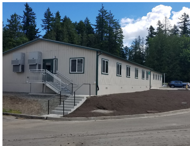
New modular building at CKTP