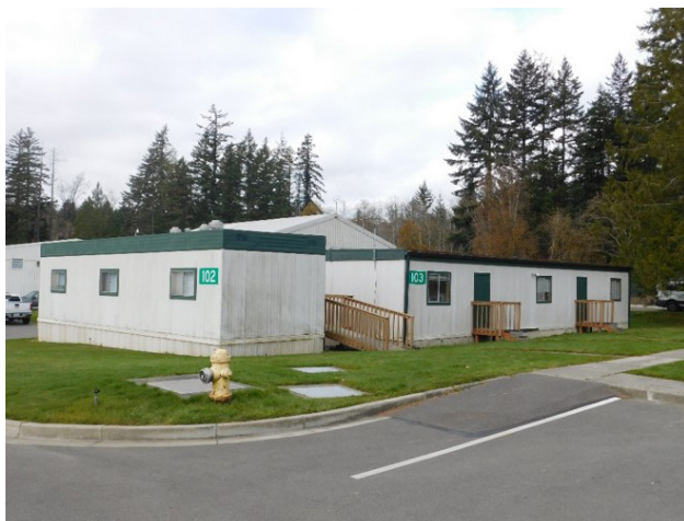
Old staff trailers at CKTP

The new buildings are code compliant with updated telecommunications and an efficient electrical and HVAC system. A pre-manufactured building was selected for this project with cost in mind. In addition, there is potential to relocate the building within the CKTP campus to accommodate future expansion.