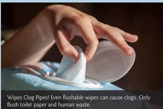
Wipes Clog Pipes! Even flushable wipes can cause clogs. Only flush toilet paper and human waste.