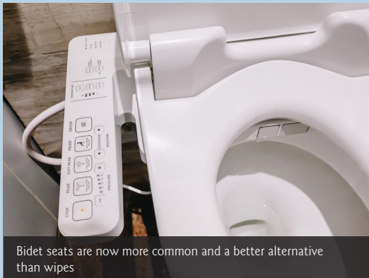
Bidet seats are now more common and a better alternative than wipes