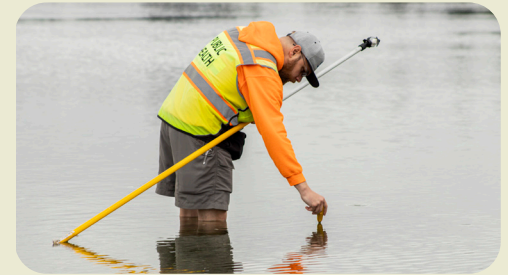
Monitoring water quality