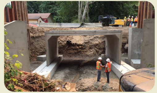
Building stormwater infrastructure