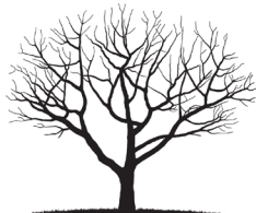
BEFORE (Unpruned Tree)

After the first two years, your rain garden plants might need annual pruning or branch cutting to keep vigorous vegetation in control and away from roads and walkways. Pruning should be done in the early fall, so that plants have time to recover before freezing weather. If you don't want to prune regularly, consider plant choices that are smaller and more compact (ask your local nursery for suggestions or consult the Rain Garden Handbook at www.kitsapgov.com/pw/raingardens.pdf ).