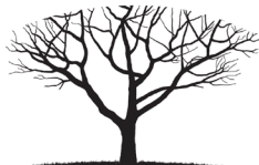
NOT THIS (Incorrectly Pruned)

If a particular plant becomes too aggressive in your rain garden, it is perfectly fine to replace it or remove it.