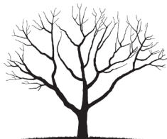
THIS (Correctly Pruned)