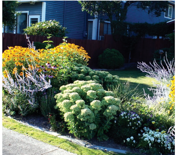
A well-maintained rain garden will reflect your style and taste