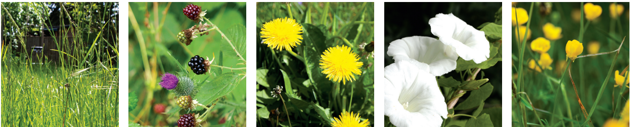
From left: Grass from lawns, Himalayan Blackberry, Dandelion, Morning Glory (Bindweed) and Buttercup

In Western Washington, you will most likely see Dandelions, Himalayan Blackberry, Morning Glory (also known as Bindweed), grass from lawns, and Buttercup in your rain garden.