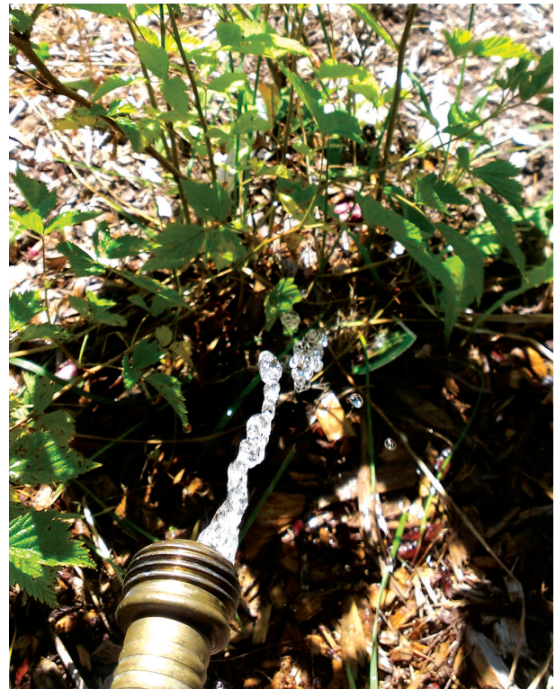
Watering the roots

Overwatering and light/infrequent watering should both be avoided because plants will